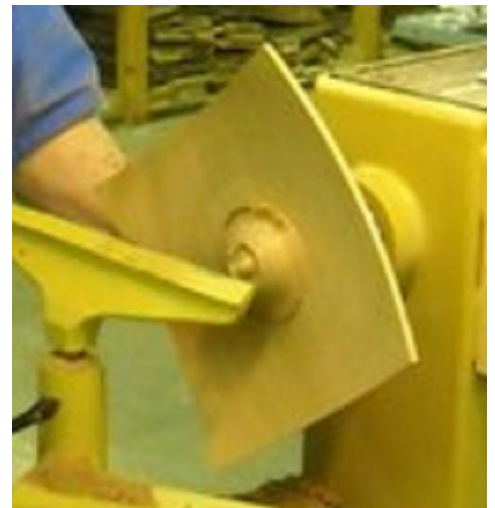
He really made it look easy....